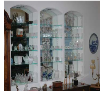
The living room alcove